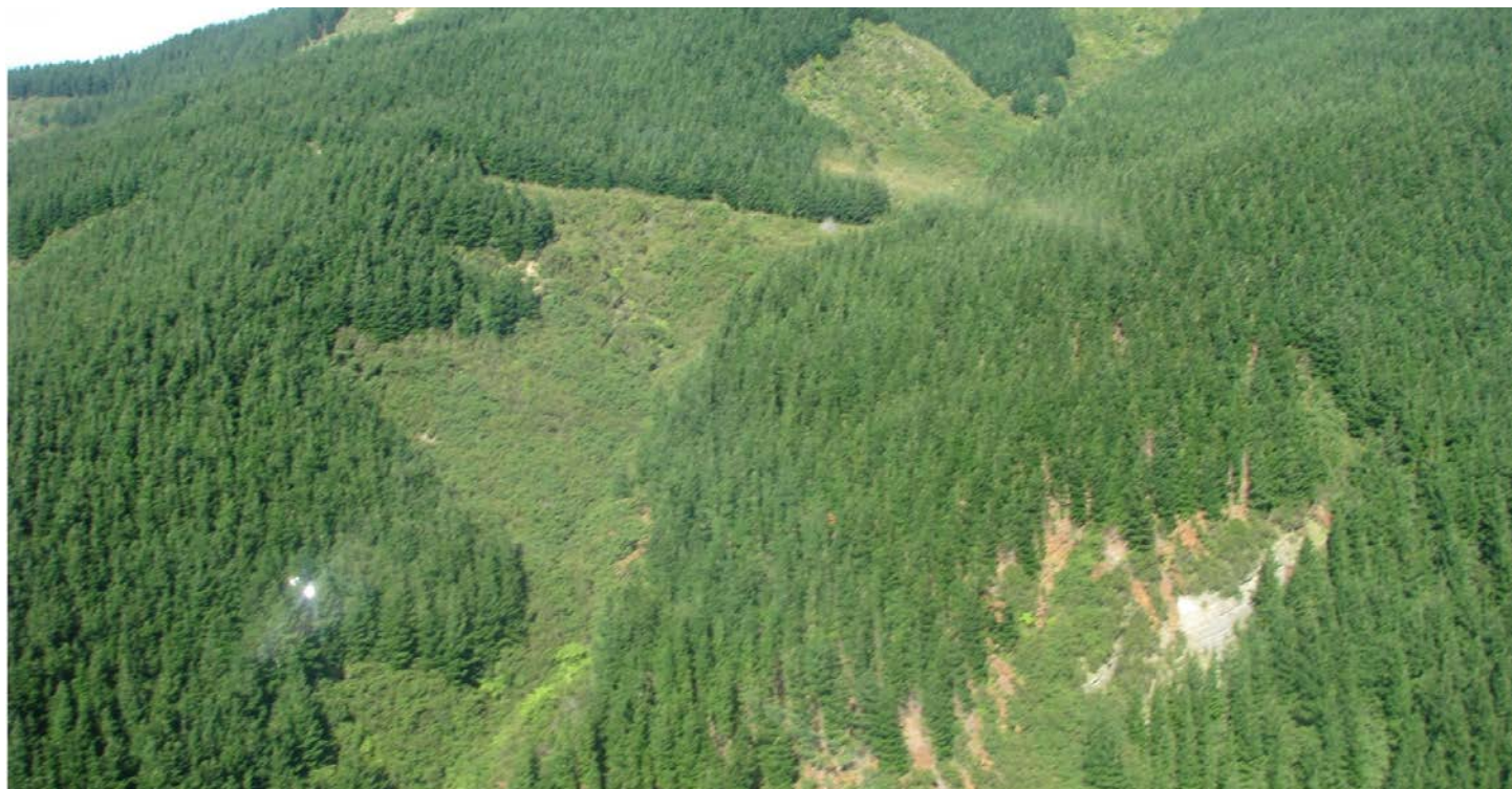
Image 2 Waiorongomai: plantation species on stable land and managed reversion on eroding vulnerable land.

Post Bola, a range of planting schemes to afforest land commenced. A large area of hill country was afforested. Plantation species were established on a wide range of land types with no provision for gully and riparian rehabilitation. Council became involved in a large number of projects, including combinations of land treatments.