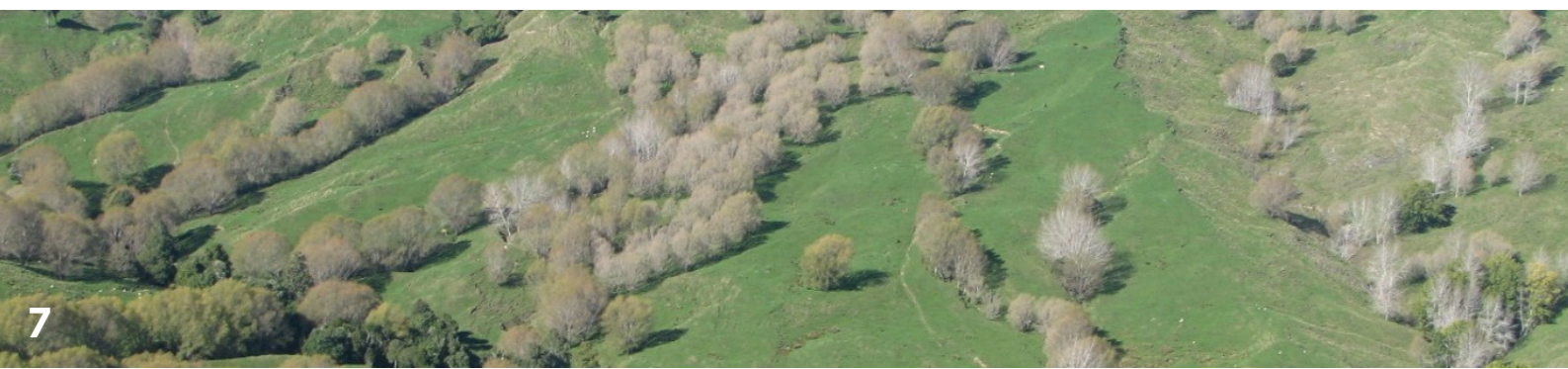
Image 1: Pauariki; however, pole planting assistance was unavailable and did not return until after the millennium.

At this time, the Catchment Board had been establishing willow and poplar in hill country in gullies and eroding slopes. Post Bola, some areas required catchment treatments with closed canopy vegetation but supported by intensive gully and riparian planting as had occurred in the Crown Forests in sensitive areas. Ongoing willow and poplar plantation on farmland was more necessary than ever.