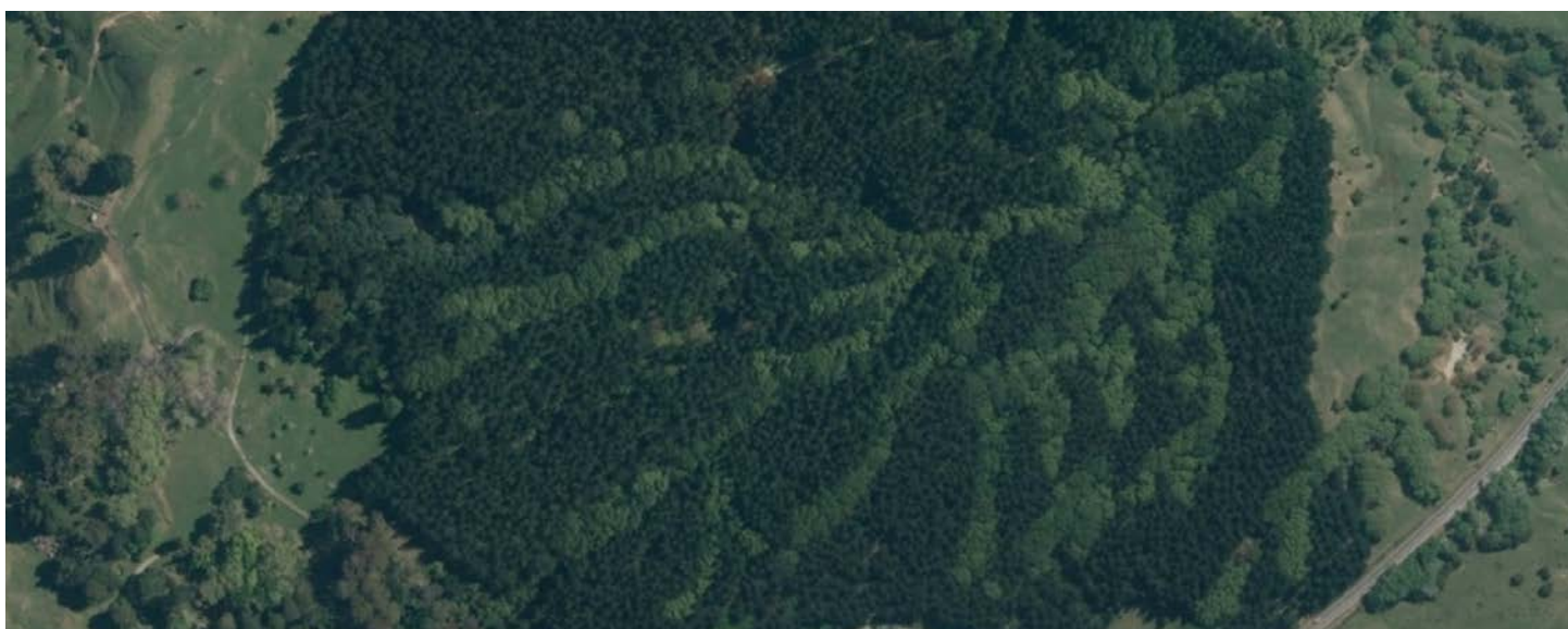
8 Image 3: Busbys

The solutions are available, and these need to be progressed. There is no one solution, but various interventions are required moving forward. These require case-by-case consideration and need to focus on all land uses.